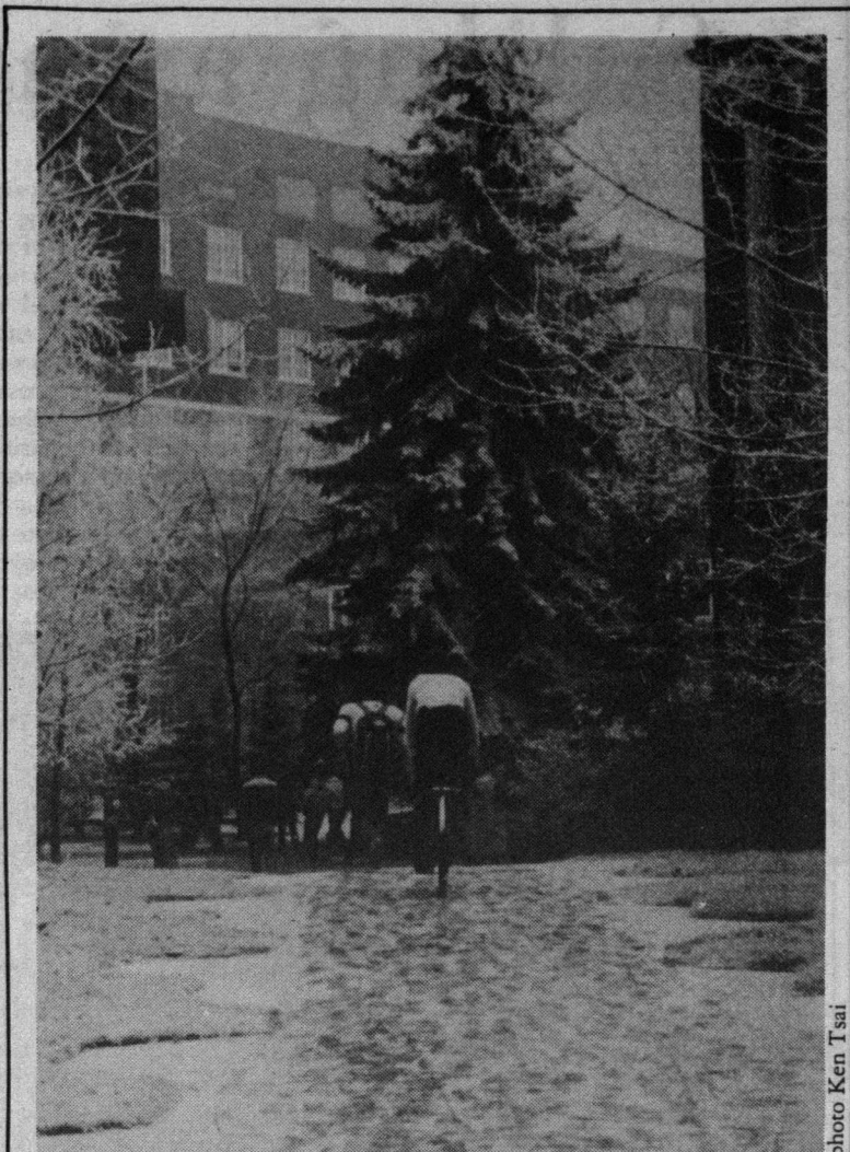
The longer I live the more beautiful life becomes.