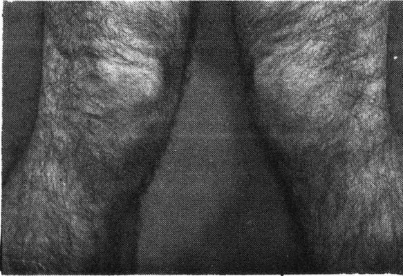
This is how the average Edmonton man looks when he's sneaking a peek at one of our Sunshine Beasts!

Yes, they are coming from everywhere , entries to the Best Sexual Organs in Edmonton Contest . Short ones, tall ones, big ones, small ones, and some where the picture stuck in the envelope. Page 4/8 will be the judge of this contest as we are neuter...er, neutral .