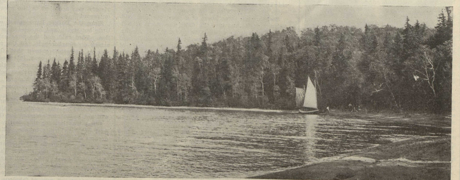
A Beauty Spot on Lake Abitibi—Called Rather Facetiously Coney Island.