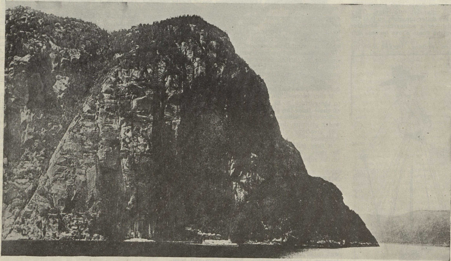
Trinity Rock on the Famous Saguenay River.