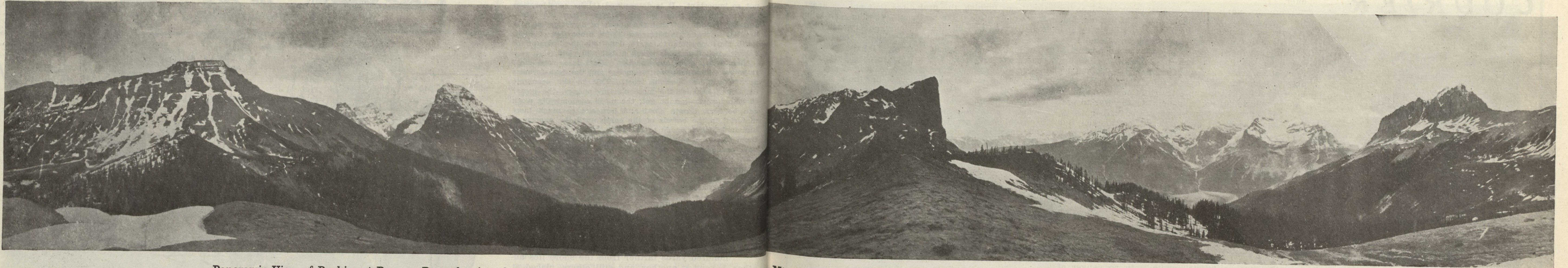
Panoramic View of Rockies at Burgess Pass, showing, from left to right, Mt. Field, Cathedral Mt., Mt. Goodier, Mt. Dennis, Van Horne Range, Mt. Burgess, Mt. Emerald, Mt. Vice-President and Mt. Wapta.