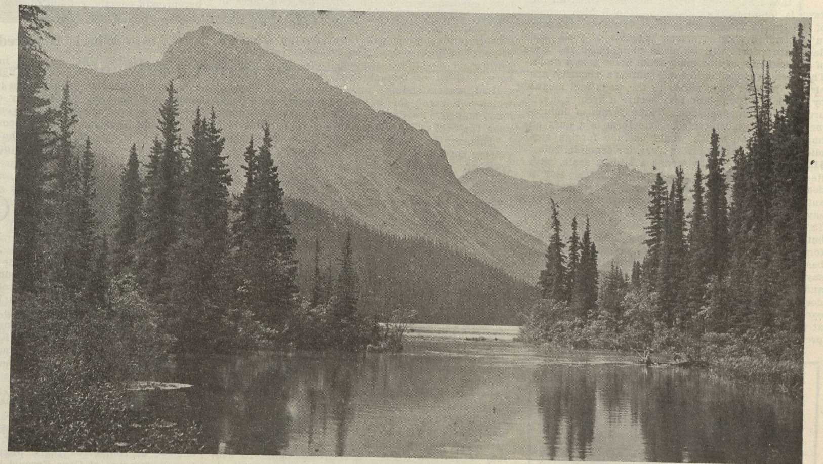
Solitude amid the unnamed mountains of Jack Lake, Jasper Park, Alberta.

THESE five chosen from various parts of the Grand Trunk Canadian Northern, the Intercolonial and the Canada Steamships Co. They were sent to the question, "Where do you find the finest landscape in all Canada?" and the photograph of Jack Lake, were direct answer to that question. The other four were left to the Canadian Courier to pick from a number of picked photographs in some doubt as to which was really the best. We have made our decision. In the five landscapes, two of which are river scenes, it is safe to say that the pictures on the page as high a level of superb pictures to civilization. The more difficult striking and beautiful five is actually due to say, and prefer to leave that to the judgment of readers.