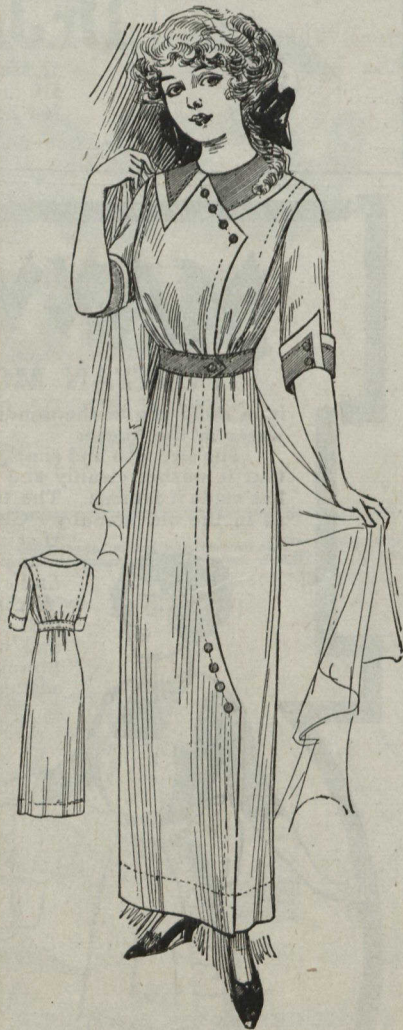
Dress Pattern No. 7385

NO dress is more fashionable nor better liked than the one that is made in semi-princess styles. This model includes the overlapped edges that are so new and so attractive and is adapted to an infinite variety of materials. In the illustration white linen is trimmed with rose color, but taffeta