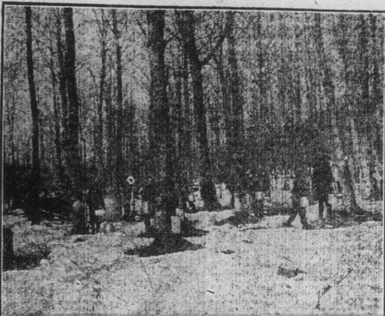
PUTTING OUT THE SAP PAILS.