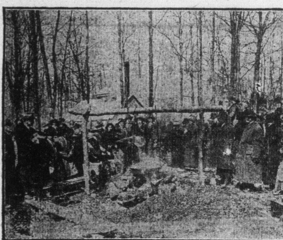
GUESTS AT THE "SUGARING OFF".

cautionary measures can be taken that will obviate most of the injury.