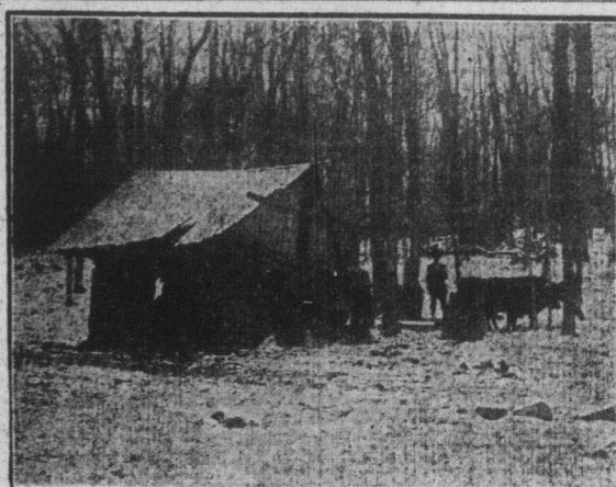
AN OLD TIME SUGAR HOUSE.

Leave Waterloo.—10.00 A.M. and thereafter every 20 minutes until 10.20 P.M., 11.00 P.M., 11.40 P.M., 12.20 A.M.