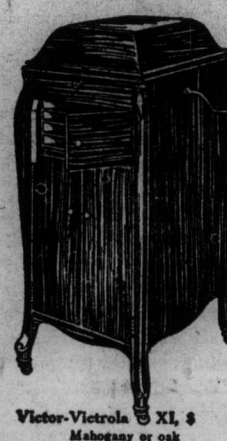
Victrola Victrola 3 XI, 8 Mahogany or oak