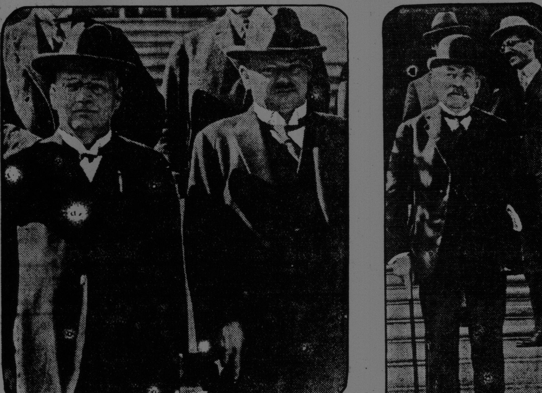
Representatives of the European powers meeting at the Security Conference at Locarno, Switzerland, to establish a Rhineland Compact and discuss the admission of Germany to the League of Nations. Dr. Luther, left, the German chancellor; and Dr. Stresemann, German foreign secretary, are shown above. Aristide Briand, French foreign minister, is shown at the right. He heads the French delegation in negotiating with the old enemy and with the assembled powers in trying to avoid another war over the Franco-German frontier.