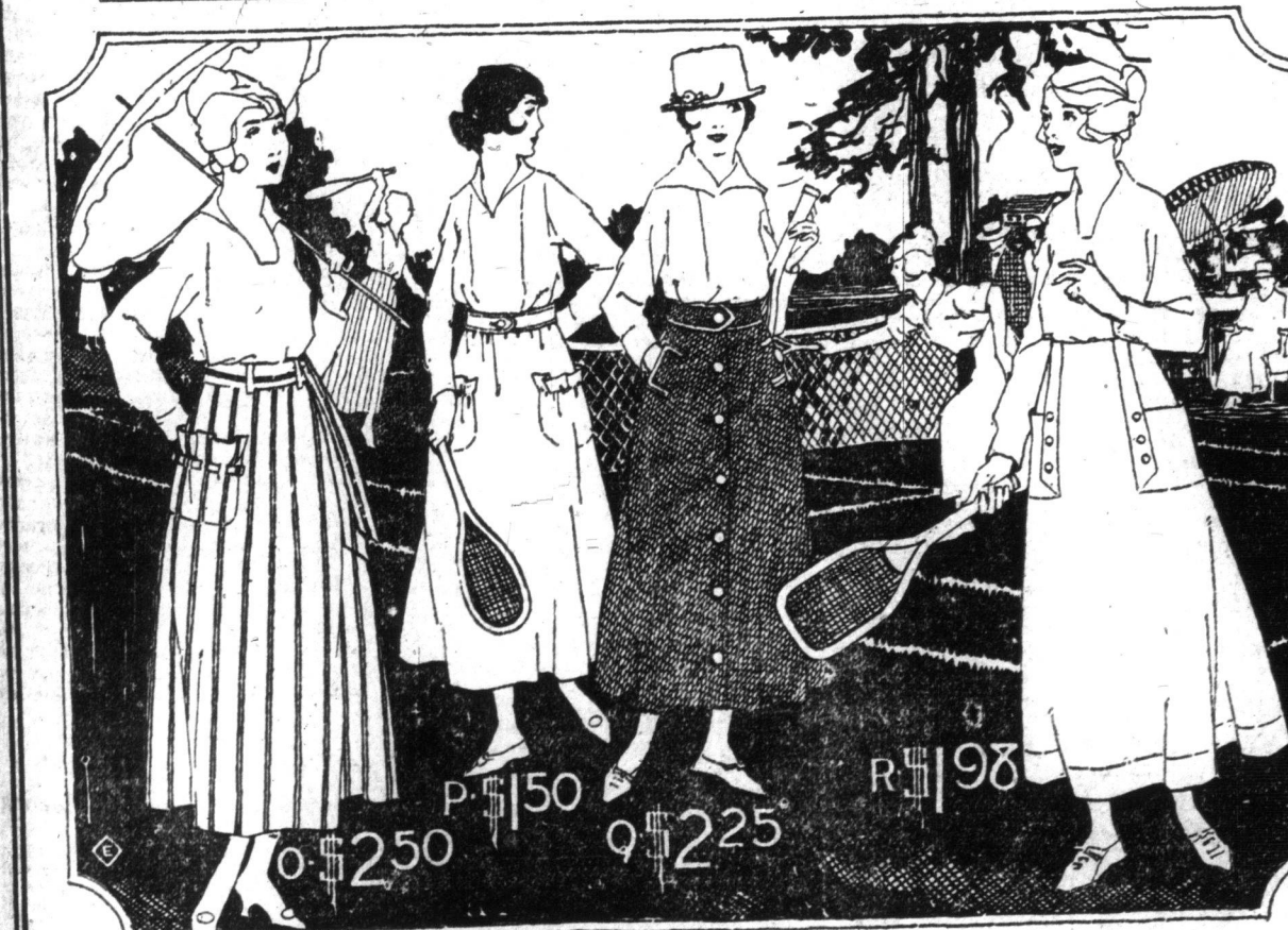
O. In striped Beach cloth. Assorted colored stripes. Sizes 22 to 30 waistbands. Price, $2.50. P. In various cotton gabardine weaves. White only. Sizes 22 to 30 waistbands. An extra value at $1.50. Q. In mercerized Beach cloth. White. Copenhagen, rose and vesado, with white pipings. Price, $2.25. R. In white Russian cord. Sizes 22 to 30 waistbands. Price, $1.98.

A BARGAIN extraordinary for early-morning shoppers—this well-cut, well-made skirt, illustrated above. It is made of white duck, a style of skirt much in demand for tennis, golf, also for waitresses' wear in tea-rooms and restaurants. Sizes are 22 to 29 waist measure. Monday, 8.30 a.m.—special, 50 cents each. —Third Floor, Centre.