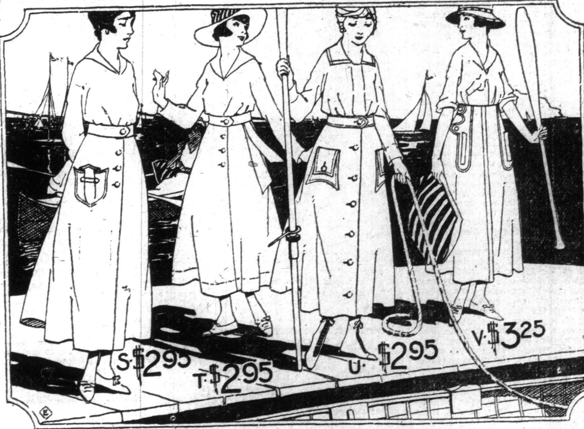
S. In fine, white only, basket weave, with fancy stripes. Sizes 22 to 28 waistbands. Price, $2.95. T. In fancy white cord. Sizes 22 to 28 waistbands. Price, $2.95. U. Imported model in satin-finish self striped repp. Price, $2.95. V. Imported model in fine white gabardine. Price, $3.25.

Out-of-Town Customers Who wish to order any of the skirts illustrated on this page are requested to state their second and third choice—to be supplied in event of the model of their first choice being sold out. Address all orders to the Shopping Service.