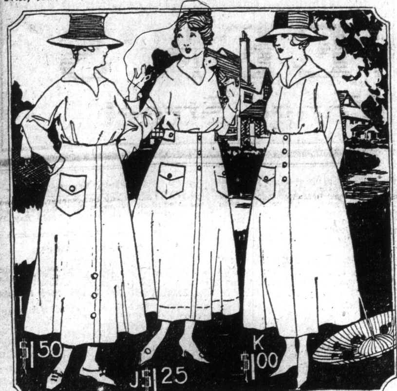
I. In English wide waist pique—model for stout figure, in sizes 28 to 38 waistbands. Price, $1.50. J. In fine quality cotton gabardine. Extra sizes, 30 to 38 waistbands. Price, $1.25. K. In fancy white cord. Extra sizes, 30 to 38. An extra special value at $1.00.

THE skirts are of washable materials in the season's most modish weaves and colors, carefully tailored in simple, smart designs in a selection so wide as to meet the requirement of every type of figure, and the demand of every summer-time occasion. The majority of them are faithful copies of high-priced imported models. Every skirt has been made specially for this event, and will be shown for the first time on Monday. In point of price-attraction, the Department has put forth every effort to present the most notable array of values which it has ever featured in fashionable outing skirts.