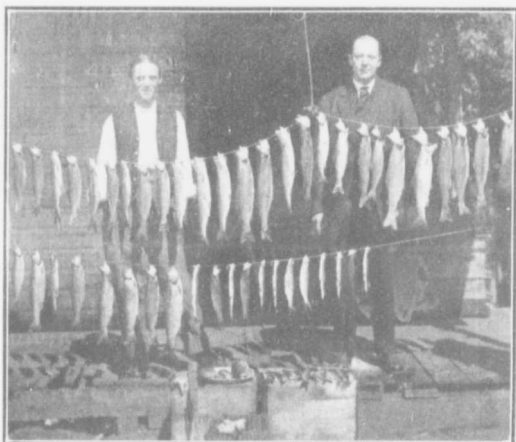
A Two Hours' Catch

living. Desirable land close to the City can be had in small plots, nearly all under irrigation, which is essential to success.