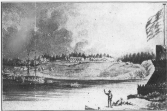
NIAGARA IN 1810

But this round of pleasure is by no means all Niagara has to offer its visitors. The town and neighborhood fairly beam with historic memories, and in every direction there are many points of interest. Among those of military fame, recalling the days of Brock and Simcoe, and the famous deeds im-