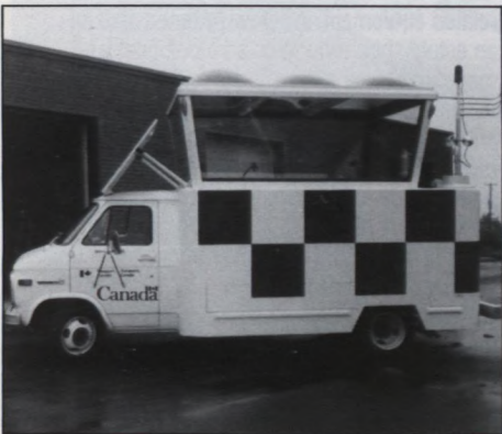
◀ Mobile control tower