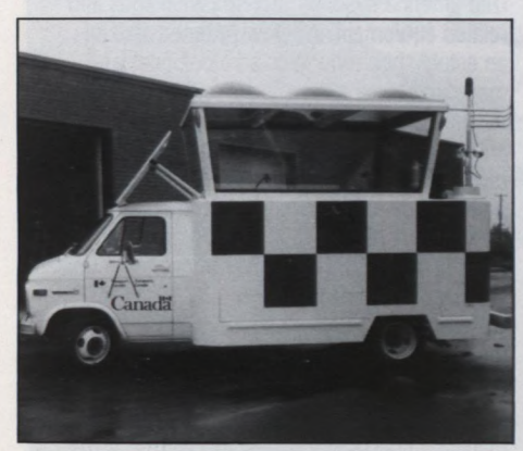
■ Mobile control tower

Amerace Ltd. is an electrical products company specializing in airfield lighting equipment for military and civil installation in several countries. This well-established company has modern facilities comprising design, engineering, manufacturing, sales and administration units. The company, through its 4 645 m² (50 000 sq. ft.) plant, markets its commercial electrical products and components, as well as its airfield lighting equipment, from coast to coast in Canada and worldwide.