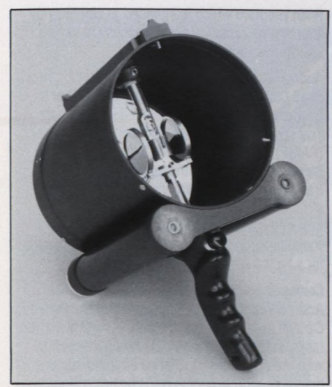
◆ Air traffic control signal light gun