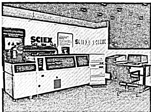
The TAGA® 6000 MS/MS System at the 1982 Pittsburgh Conference in Atlantic City, N.J.

The TAGA® 6000 MS/MS System includes an extensive array of hardware features designed into the system to take full advantage of this powerful new instrument concept. Computer-aided design of ion transfer techniques, a well-defined CID gas target and high performance quadrupoles ensure optimum transmission of ions through the system. Two stages of collision-induced dissociation (CID) and up to 150 eV of collisional energy maximize the information obtainable. The open-geometry Atmospheric Pressure Chemical Ionization Source produces the molecular ions especially suited to MS/MS and is exceptional in that the only maintenance required is an infrequent 10 minute clean-up. An ultra-high capacity, ultra-clean cryopump and a totally automated and failsafe vacuum system form the heart of the TAGA® 6000 MS/MS. Positive and negative ion pulse counting with extremely low system noise enable detection of many compounds in the low picogram or ppt range.