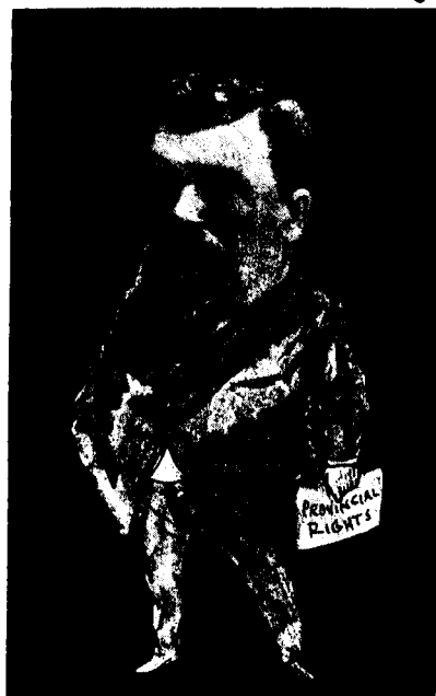
HON. THOS. GREENWAY.

THIS burly gentleman is the leader of the Liberal party in Manitoba, and continues by grace of the popular vote just given to be Premier of the Provincial Government. Mr. Greenway is an Ontario man, one of the many who went West years ago to grow up with the country. He seems to have made a decided success of it, and the mark of increased confidence which has been placed upon his Government must be an agreeable compliment. The election turned almost wholly on the Separate school issue, the Government party standing for the abolition of any State aid to Separate schools, and the Opposition seeming to be shaky on the point. The emphatic majority makes it quite clear what the people of Manitoba think. There is promise of race and religious troubles, however, as the French Catholics regard Separate schools as a sacred birthright of theirs in the Western Province.