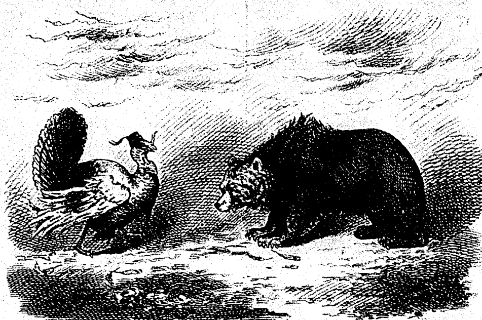
THE BEAR AND THE TURKEY.