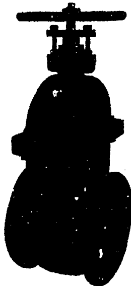
Flanged End Gate Valve with Hand Wheel.