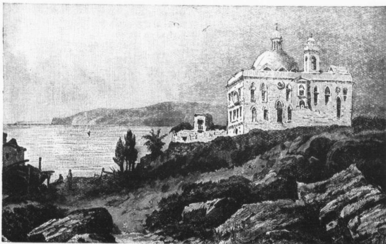
CONVENT ON MT. CARMEL.—Illustrating "The Palestine of To-day."

"Abreast of the most popular literary magazines. The articles are by scholarly men and good writers."— St. Louis Methodist .