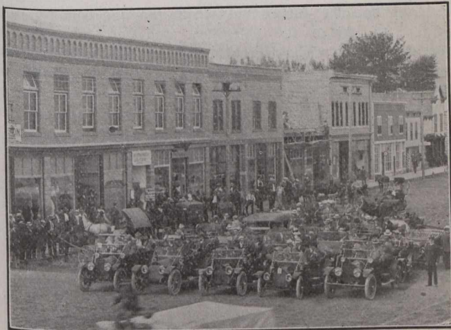
The Delegates Being Entertained at Kelowna.

Everybody interested in irrigation and agriculture in the United States has heard of the National Irrigation Congress. All know what a powerful, influential organization it is to-day, and how delegates from the four corners of the country come together, year after year, in some chosen city, to follow the deliberations and resolutions of that association.