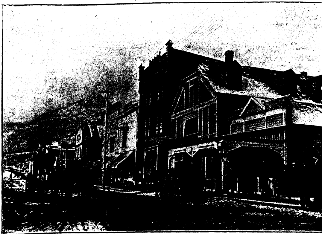
COLUMBIA AVE. FOUR YEARS AGO