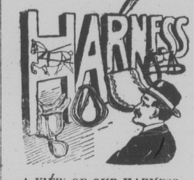
A VIEW OF OUR HARNES.

will show that it is more than merely good looking. It is good as well. If you need any whether it be a full set or any part of one, we shall be glad to supply you with the best at prices that compete with those charged by others for much inferior grades.