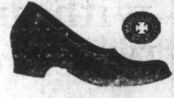
Ladies' Low Rubbers. Black or Tan, high or low heels; all sizes and widths.

Best on the market. Double wear in each pair.