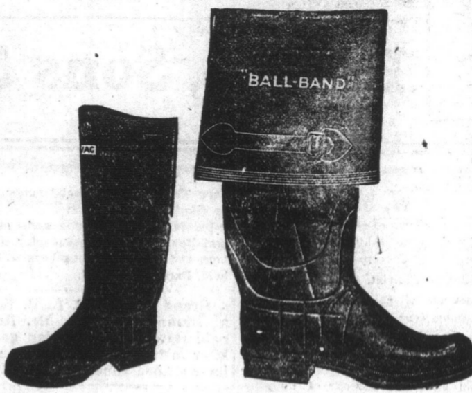
RED BALL VAC.

Best on the market. Double wear in each pair.