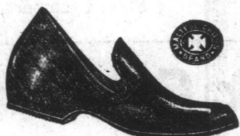
Ladies' Storm Rubbers. With high and low heels.