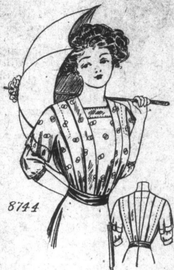
Lady's Over-Blouse With Body and Sleeve in One With Tuckers.

This graceful model may be worn over a guimpe or made with the tucker supplied in the pattern. As here shown figured foulard was used. The design is equally appropriate for lawn, chambray, messaline, poplin, or cashmere. The body portions are finished with box plaits and a deep Gibson plait over the shoulder. The pattern is cut in 6 sizes: 32, 34, 36, 38, 40, 42 inches bust measure. It requires 2 1/2 yards of 22 inch material for the over blouse and 1 1/2 yard of 32 inch material for the Tuckers.