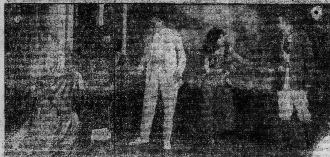
SCENE FROM "FAIR AND WARMER," COMING TO THE GRAND ON THURSDAY NIGHT.