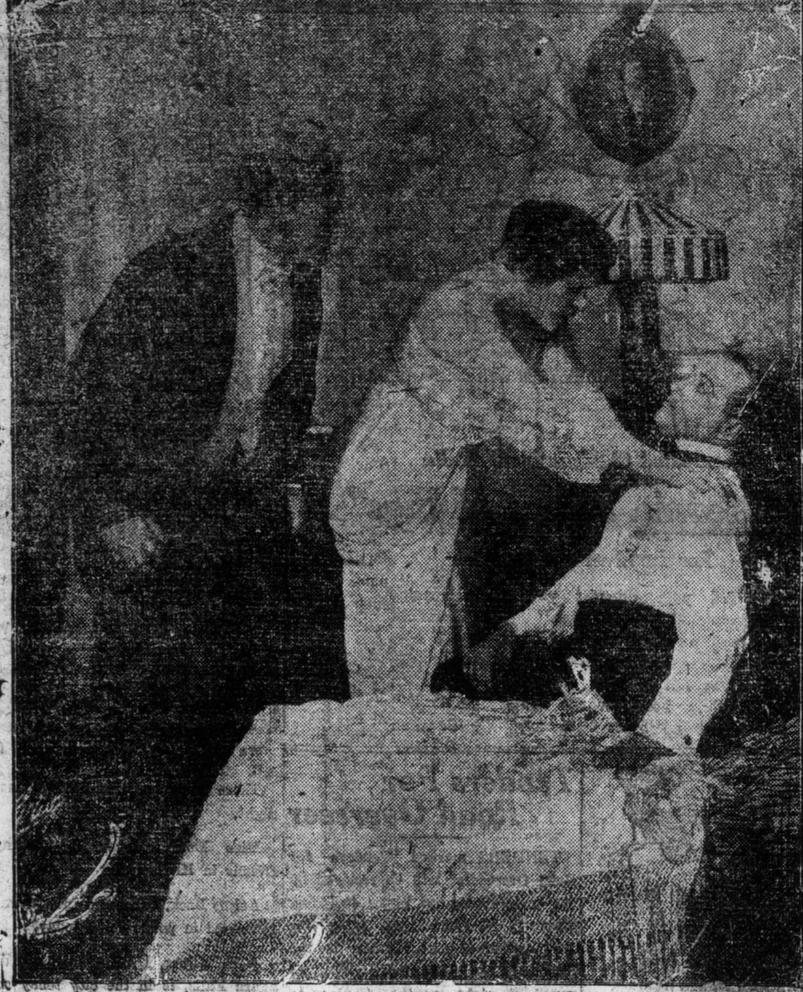
Scene from Avery Hopwood's tale of laughter "Fair and Warmer" at Grand Opera House Thursday night.

TORONTO, 43 King St. West Tel. No. M. 3561