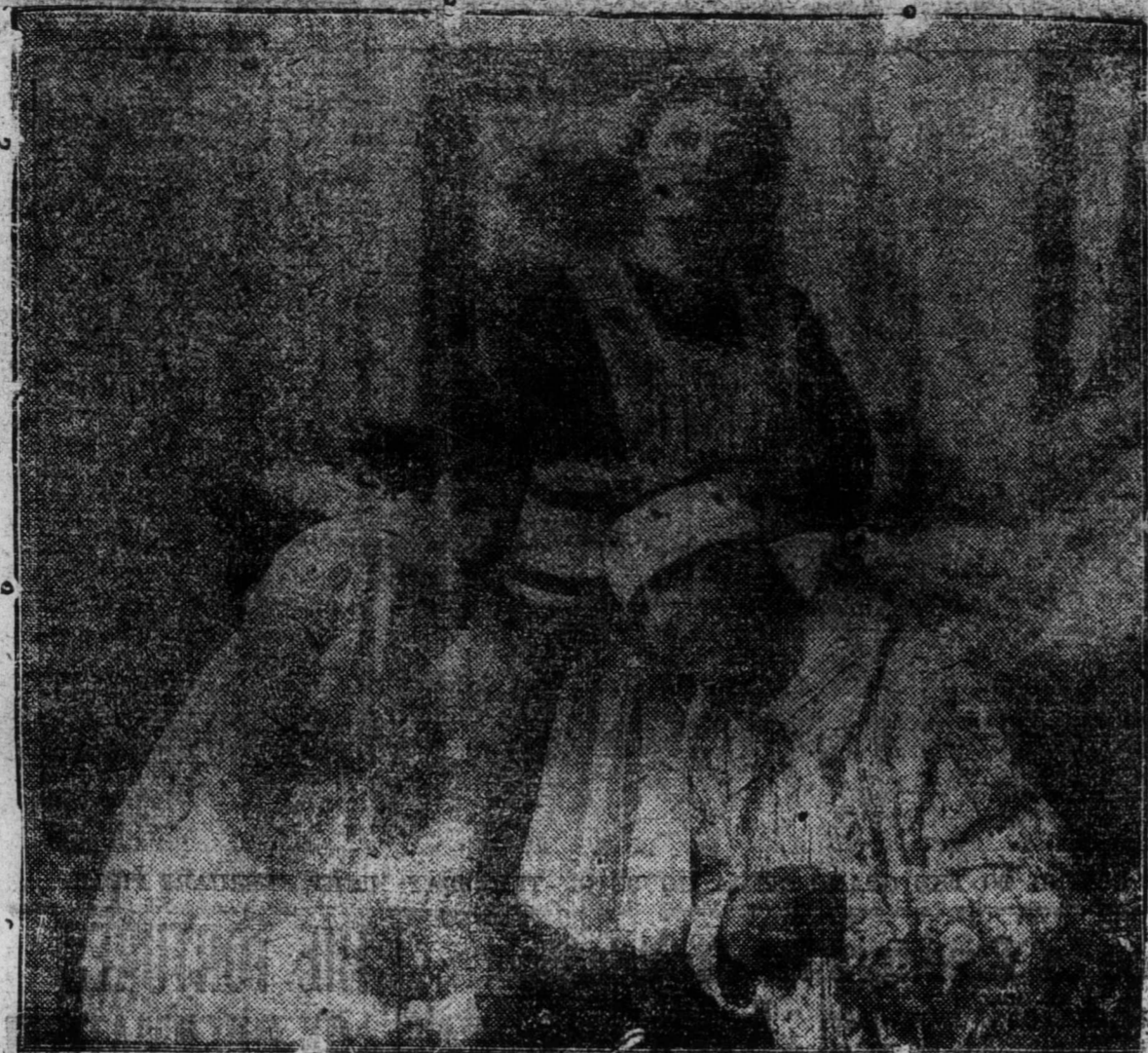
Scene from Avery Hopwood's farce that made the writer famous, "Fair and Warmer," at the Grand Opera House, Thursday night, Feb. 5th.