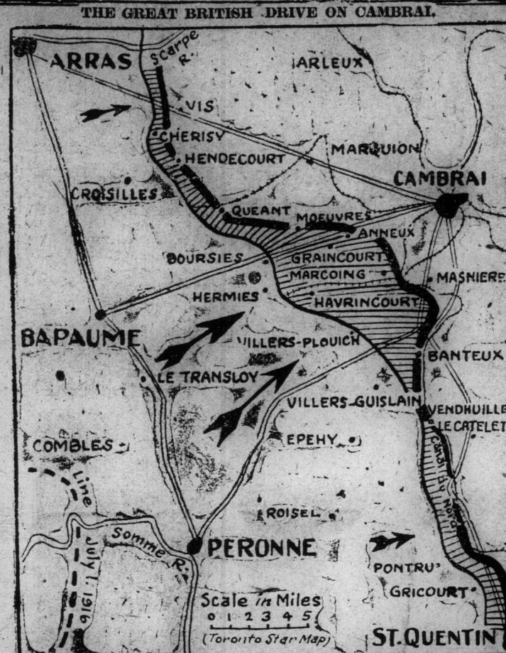
The shaded area on the map indicates the gains made by the British in a 30 mile front between St. Quentin and the Scarpe River.

Many German merchants in New York are unable to enter their own alien zone declaration.