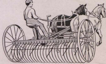
Built for Hard, Quick Work.

Because a Rake looks a simple machine to make don't put up with cheap, inferior workmanship—get a Frost & Wood and save real money. Teeth of special quality tempered steel, and arranged in convenient sections of two or three. Self-dumping, discharging load automatically at light pressure on foot lever. Made of steel, amply strong, clean working, the Frost & Wood Rake gives a lifetime of splendid service.