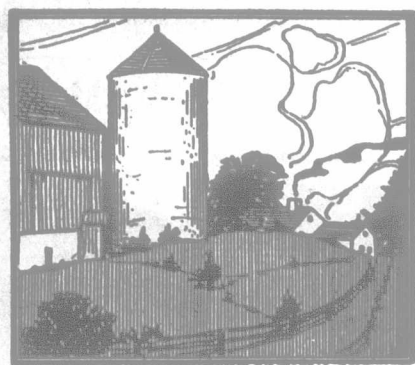
CONCRETE is the ideal material for barns and silos. Being fire, wind and weather proof, it protects the contents perfectly.

self and your regular help. This allows you to take advantage of dull seasons, when you would otherwise be idle. The mixing and placing is simple, and full directions are contained in the book which we will send you free.