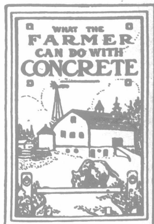
THIS book of 160 pages, handsomely bound and illustrated with photographs, was the first, and is the best work describing the farmers' uses for concrete ever published. See free offer on this page.

Canada Cement Company LIMITED Farmers' Information Bureau 550 Herald Bldg. MONTREAL, QUE.