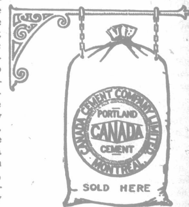
THIS sign hangs in front of nearly all our dealers' stores. Let it guide you to the place where the best cement is sold.

I F you haven't received a copy of "What the Farmer Can Do With Concrete," write for it at once. It will be sent absolutely free, without obligating you in any way. Use a post card or clip out the coupon. We will also send particulars of the 1912 Cash Prize Contest. Address: