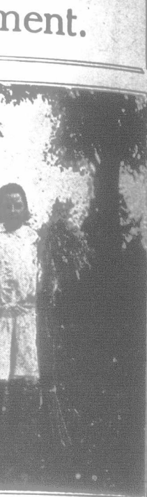
the School Fair. school girl and her school