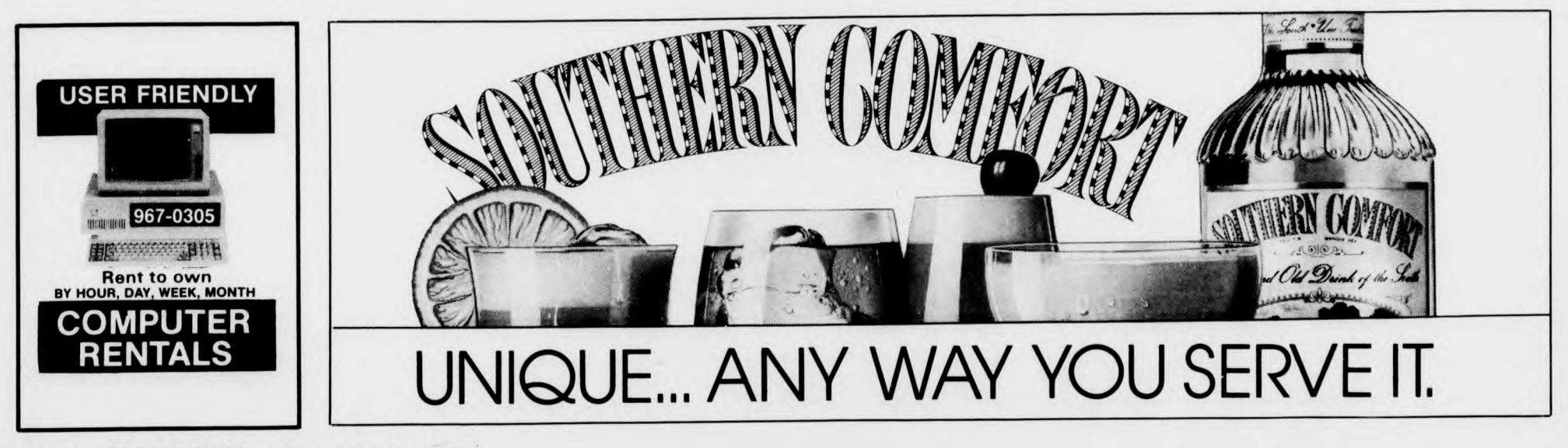
Page 8 EXCALIBUR November 13, 1986

EXCAL: So it's more profitable to do it on your own then?