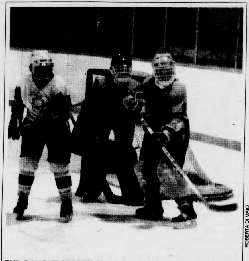
END OF HOME SEASON: The York Yeowomen broke away from the clutches of the Golden Gaels for a 9-zip victory.