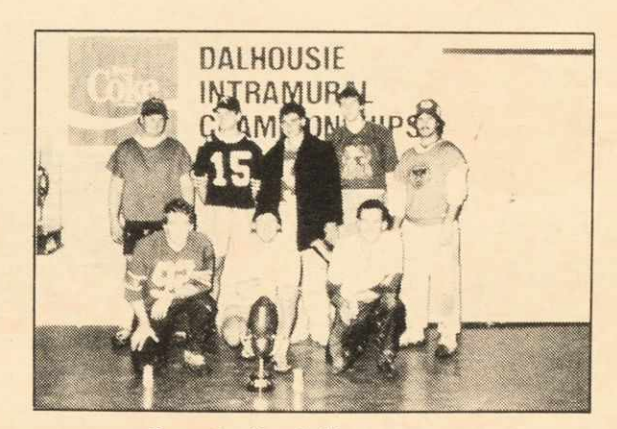
Bengals, Football Champions ("A" Division)