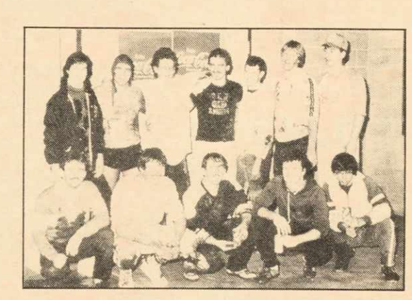
Pharmacy, Football 2nd Place ("B" Division)