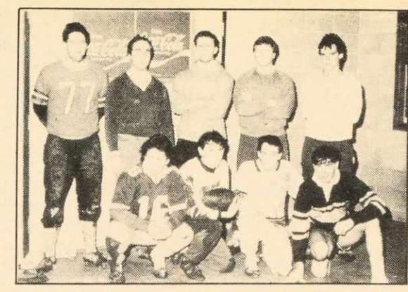
Law, Football Champions ("A" Division)