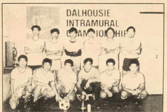
Chinese Students' Ass'n Soccer Champions ("B" Division)