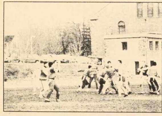
Cameron House vs. Studley, Final Game (Residence Division)