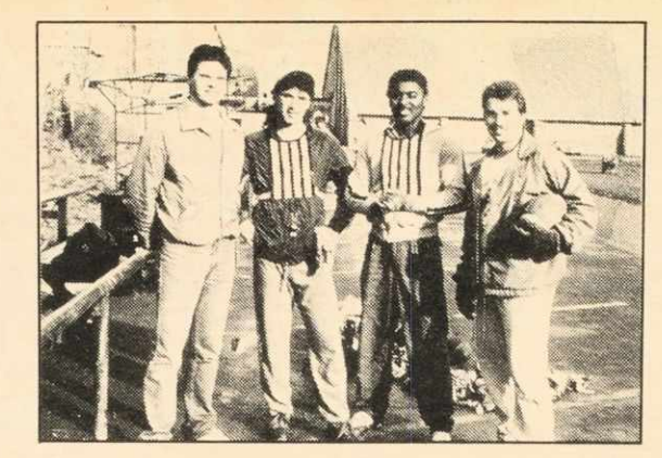
Officials, Convernor and Supervisor