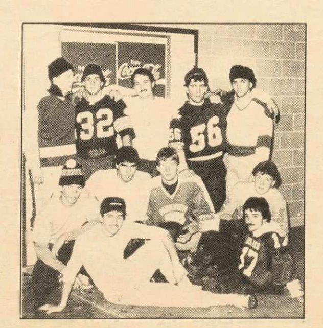
Studley, Football 2nd Place (Residence Division)