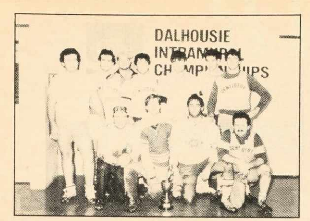
Dentistry Football ("B" Division Champions)