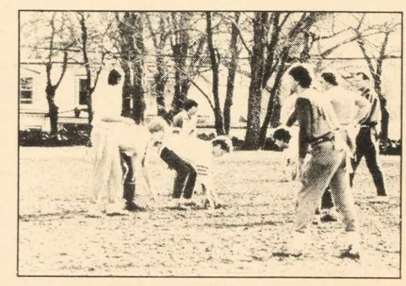
Dentistry vs. Pharmacy Football Final ("B" Division)

tinued support, and to the entire intramural staff for their hard work and dedication. Happy holidays and good luck in the New Year!