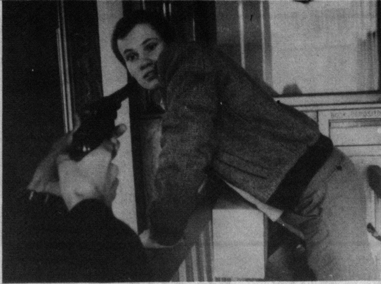
Student library offender "learns the hard way"