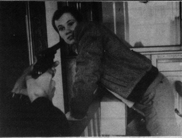
Student library offender "learns the hard way"