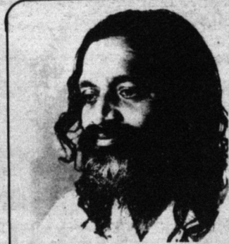
Maharishi Mahesh Yogi