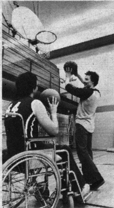
Services to handicapped