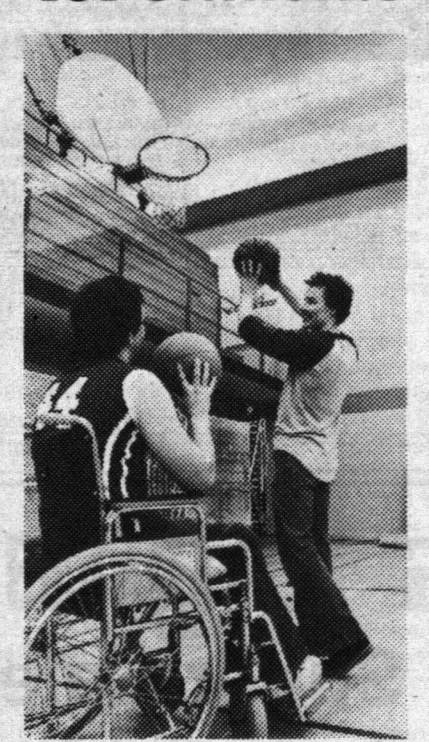
Services to handicapped