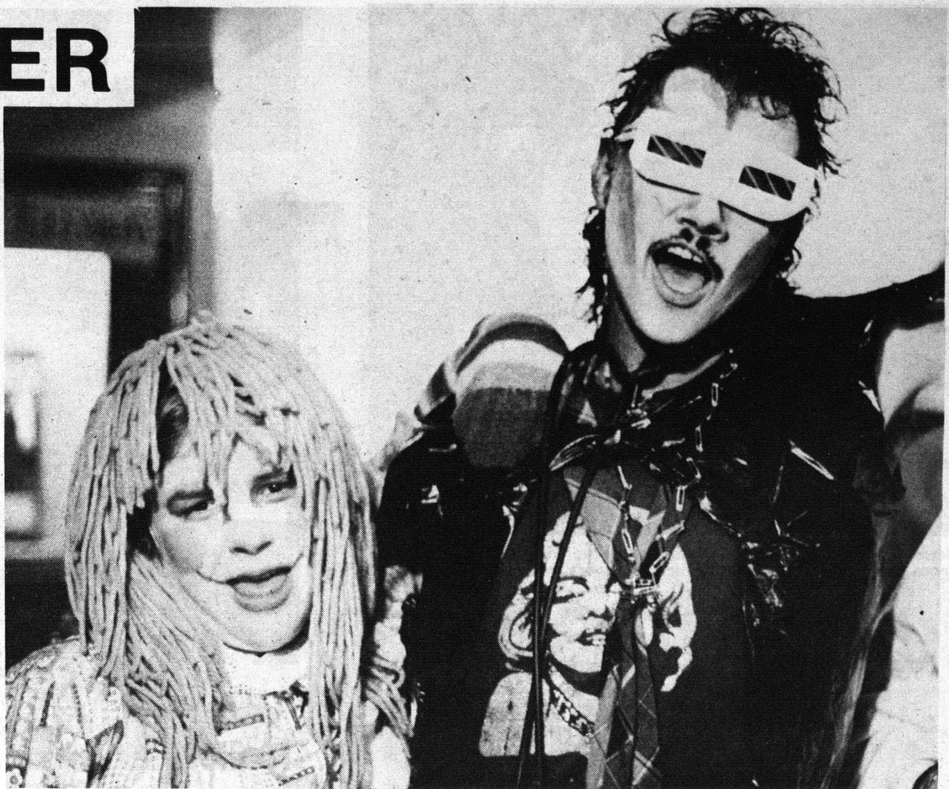
October was halloween. We caught these Bridge staffwriters on their way home to get dressed up for an old-fashioned night of tricks and treats.

52 percent of the students who took the writing competence exam during registration week failed with flying colors.