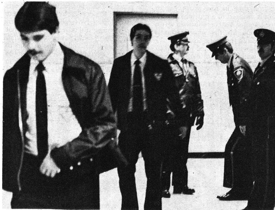
Bomb Scare? October was plagued by them.

HUB-Fine Arts overpass was delayed, but this was perhaps just as well. Fine Arts and Law students may have been deterred from venturing into HUB where they would have been nauseated at the unsanitary conditions, or else physically assaulted by falling four-by-fours and short-tempered workmen.