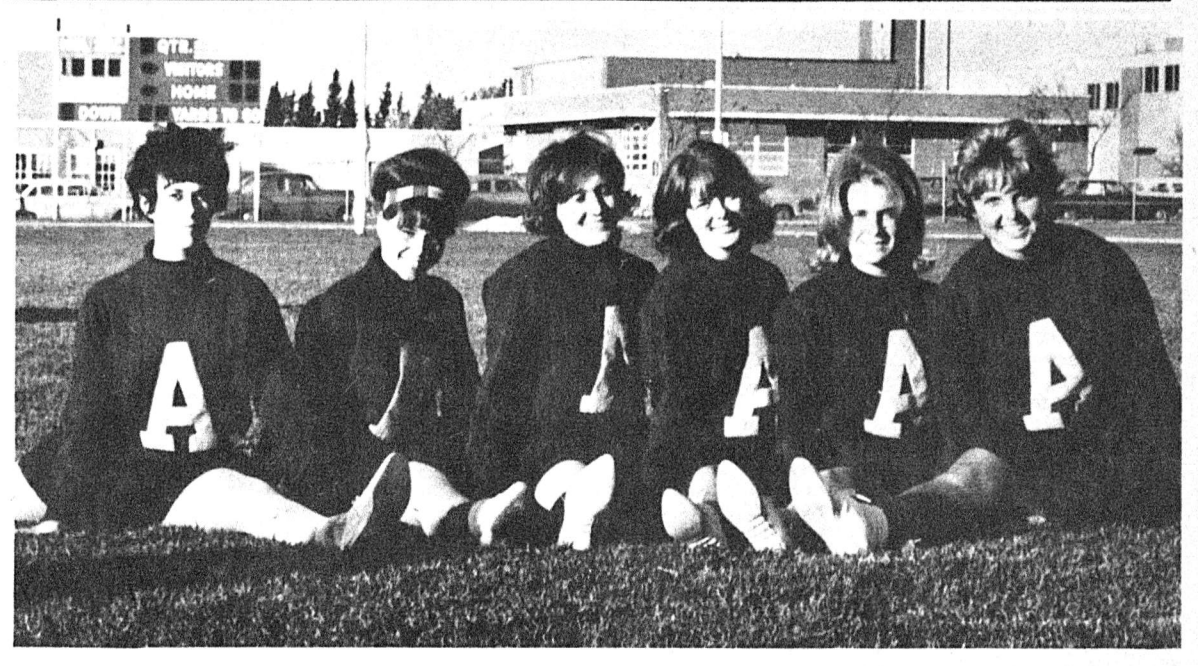
CHEERLEADERS PREP FOR GALA FOOTBALL WEEKEND