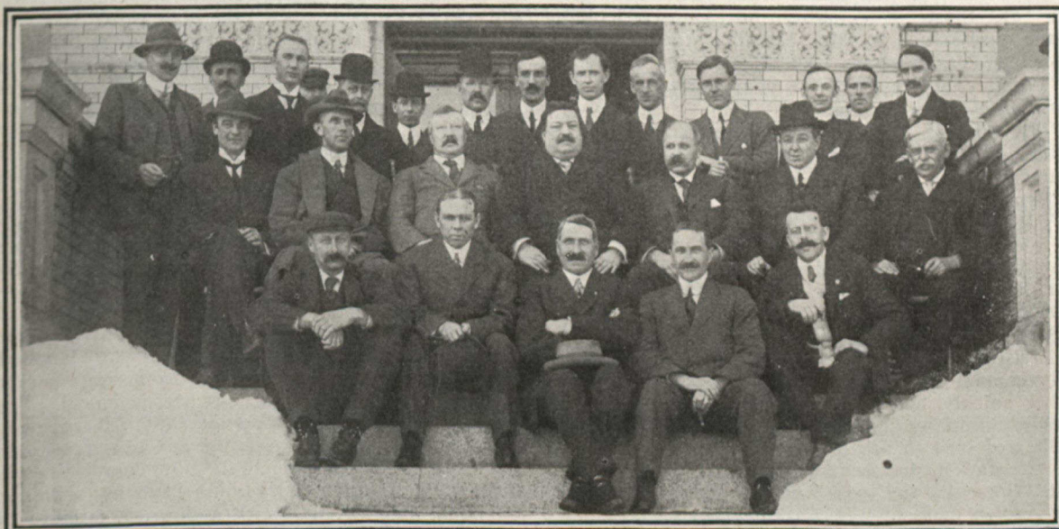
Annual Convention of Mountain Lumber Manufacturers Association—held at Nelson, B.C., Jan. 19. These men represent over seventy large mills in the Kootenay, and an investment of $50,000,000.