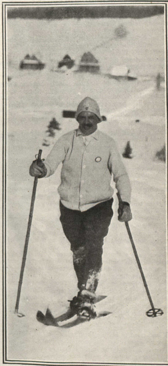
Ski-ing is more popular in Canada this year than ever. This photo was taken at St. Agathe, P.Q., last week.