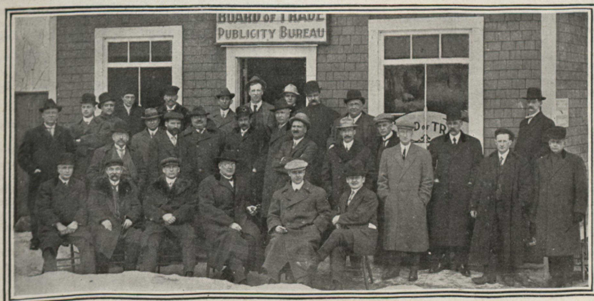
Annual Convention of Associated Boards of Trade of Eastern British Columbia—held at Rossland, B.C., Jan. 17 and 18.—known locally as "The Parliament of the Kootenay."