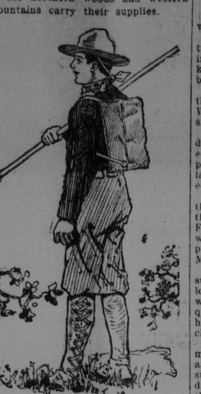
BOY SCOUT WITH A "NESSMUK" PACKSACK.