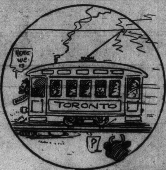
FIRST CIVIC CARS