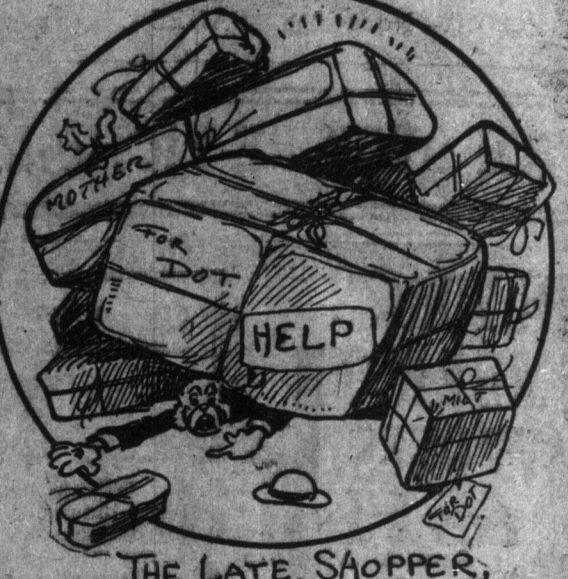
THE LATE SAOPPER