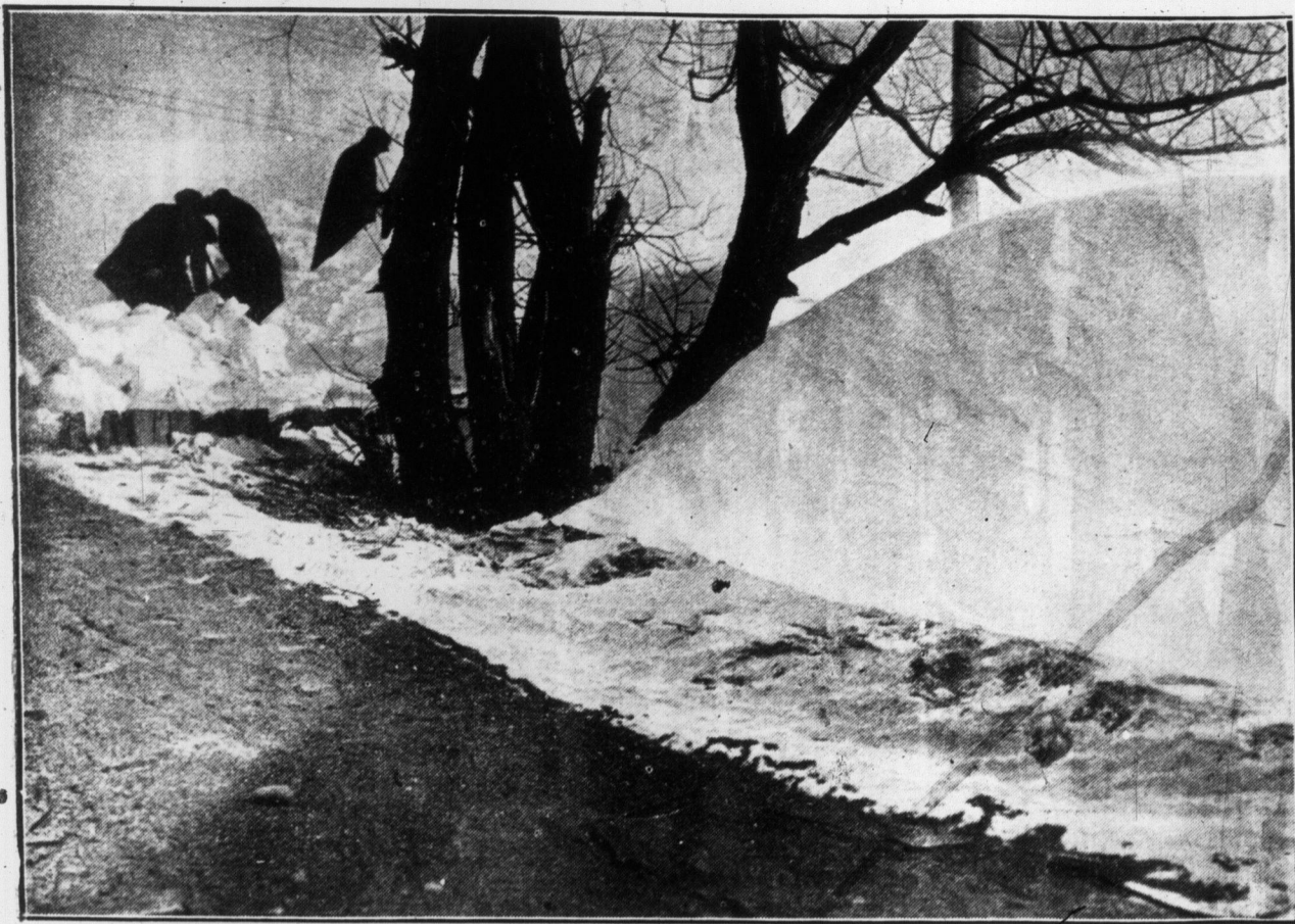
HUGE DRIFT THRU WHICH THE STREET-CLEANING MEN HAD TO CUT TO OPEN THE ROAD TO FISHERMAN'S ISLAND.