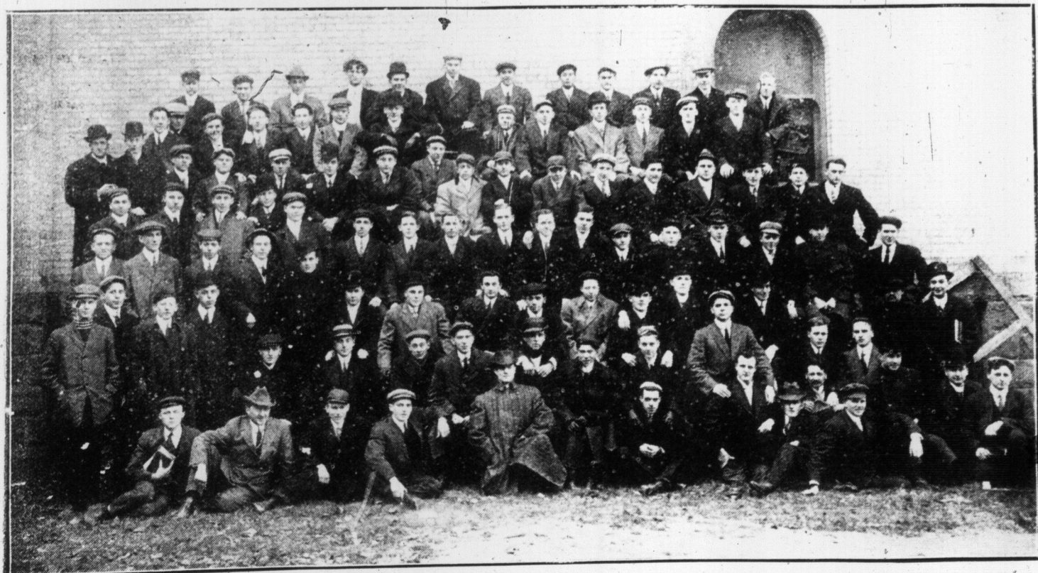
"FRESHMEN" OF THE MEDICAL FACULTY OF TORONTO UNIVERSITY.

ARNOTT INSTITUTE The work of the ARNOTT INSTITUTE in treating Stammerers and Stutters is becoming more and more widely recognized as perhaps the most successful on this continent. Following our own scientific methods, the Institute treats the CAUSE of stammering, not the habit itself. It teaches the student why he stammers, and once he understands that, it is comparatively easy for him to learn, in from five to eight weeks, how to speak fluently and naturally, without any of the objectionable mannerisms commonly taught. As he knows why he is speaking correctly, the cure is permanent. If you know anyone who stammers or stutters, in kindness to them advise them to consult the ARNOTT INSTITUTE. BERLIN, ONTARIO, CAN.