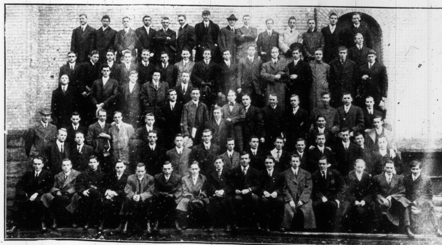
"SOPHOMORES" OF THE MEDICAL FACULTY OF TORONTO UNIVERSITY.

MA "Your p not" answ "Would tictim of "Certain and unsp "Good!" "Good!" "Yes": se popular s