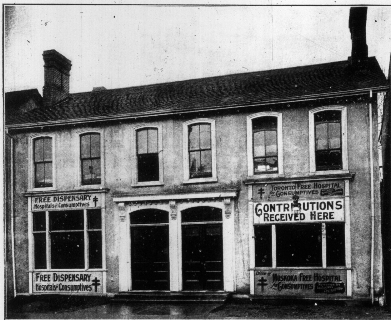
A WORTHY CAUSE. OFFICE OF TORONTO AND MUSKOKA FREE HOSPITAL FOR CONSUMPTIVES—A SPECIAL APPEAL IS BEING MADE FOR CONTRIBUTIONS.