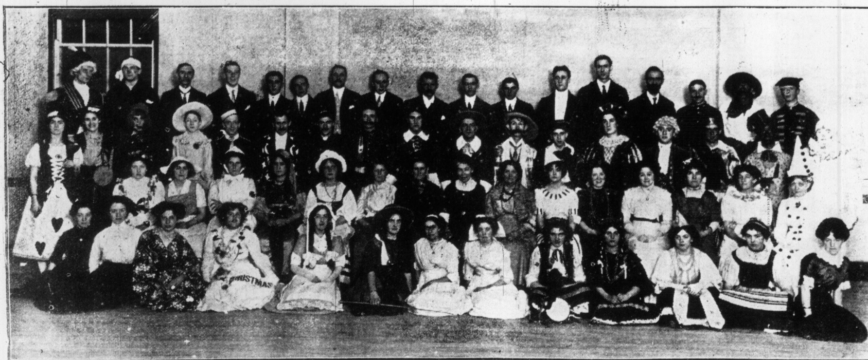
CHELTEMHAM SOCIETY'S FANCY DRESS BALL.