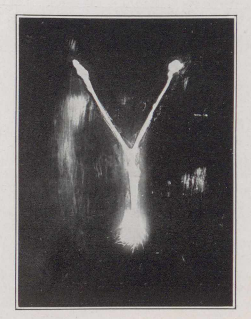
FIG. 3.-Control for Fig. 2.

1. Immature female rats from 35 to 60 grm. in weight, and from 3 to 5 weeks of age, have been used according to a slightly modified technique of Aschheim and Zondek and of Wiesner, to assay biologically the content of the ovaryactivating hormone in placental extracts. This method of assay has made possible the concentration and purification of the active principle by means of fractionation processes, to be described at a later date, to the point where one rat unit may be represented by 0.01 mgm. of dry substance. Certain micro-crystalline fractions of great potency have been obtained, but it is impossible to state as yet whether such fractions are pure chemicals. It is of special interest that immature white rats thus stimulated by the placental hormone to a state of œstrus as a rule become cyclic. Nine of these have also been impregnated by an active male in a normal manuer.