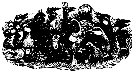
WHAT'S BROKE LOOSE?

But after all it is to his economic worth largely that the Brahma is indebted for his universal and continued favor, and which makes him as popular to-day as any other variety, after 30 years