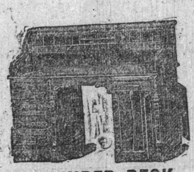
CYLINDER DESK In Oak $22. With Glass Book-case $28.

NOW, HERE TO-DAY WE SHOW PICTURES OF WHAT WE SELL AND HOW WE SELL. WE NEVER SAID A WORD TO YOU IN THE PAPERS BUT WE CAN SUBSTANTIATE.