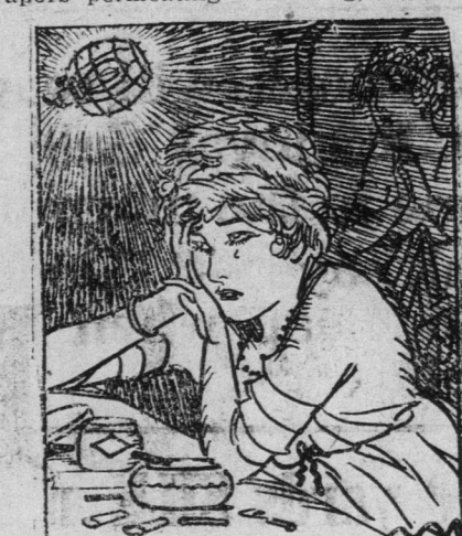
Hot tears etched grotesque paths down her made-up cheeks;