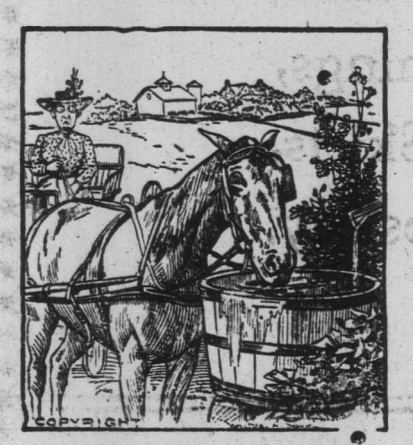
Driven to Drink

many a good man has been by home annoy him. It makes his heart glad when he can see his linen immaculate find with a snow white colorand artistic anish that he can have put on by expending only a few cents. It is worth dollars in comfort and satisfaction to have your linen laundered at the