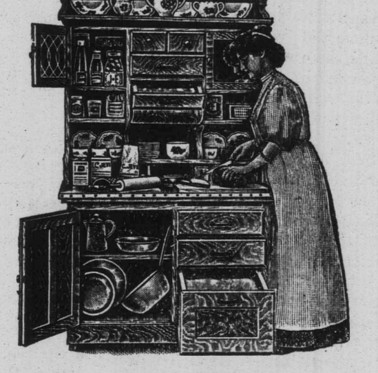
The Chatham Kitchen Cabinet

The perfection of its kind. Lesens Labor, Saves Steps, Looks Lovely. It takes the place of both pantry and kitchen table. It means the saving of hours of time everyday to your housekeeper. It means the saving of miles of walking around a hot kitchen. It means relief from kitchen drudgery. It conrains many new and exclusive features that have never been approached by other kitchen cabinets.