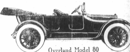
Overland Model 80

No advance in price on account of increase of 7 1/2% 'War Duty.' The price of an OVERLAND CAR, once established and advertised, is never changed during the current season.