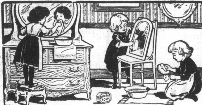
Sunlight Soap makes homes bright.

spite of the bitter weather without the least hesitation, and reached the shore without a single casualty. Our illustration of the event is taken from a sketch by Mr. Frederic Villiers, the special war artist of The Illustrated London News.