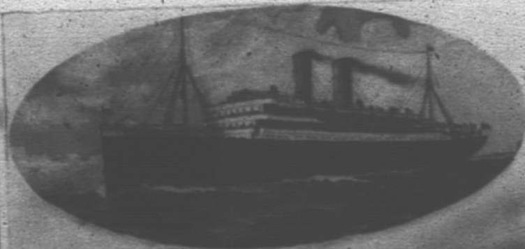
R.M.S.S. EMPRESS OF BRITAIN Atlantic Service.

TOURS IN CANADA AND UNITED STATES —Express trains Ocean to Ocean. Fishing, Shooting, Swiss Guides, Mountain Climbing. Some of the World's Grandest Scenery on the line of the Canadian Pacific Railway.