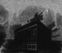
PRINCE EDWARD, BRANDON