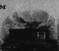
PRINCE ARTHUR, PORT ARTHUR