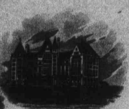
THE MACDONALD, EDMONTON

PICTOU LODGE PICTOU, NOVA SCOTIA HIGHLAND INN ALGONQUIN PARK, ONTARIO NIPISIGON LODGE ORIENT BAY, ONTARIO