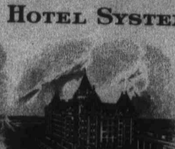
CHATEAU LAURIER, OTTAWA